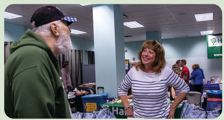
Dozens of service providers will gather at the Double Tree Expo in Manchester on September 8 to help veterans in need.

The resource expo connects local veterans experiencing or at-risk of homelessness to necessary care and supports. Resources on-hand include employment services, medical, dental, social, and legal services, a hair dresser providing haircuts, and more.