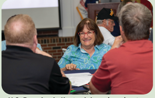
U.S. Rep. Annie Kuster joins a breakout session at the veteran summit.